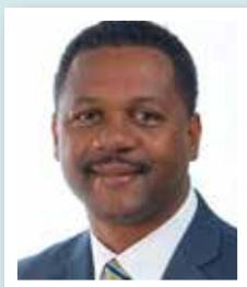
Wade Harper Mayor